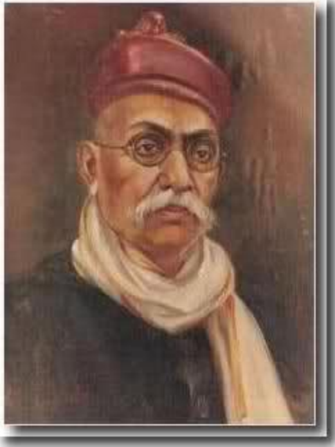
Govindrao Dabholkar (1856 – 1929)